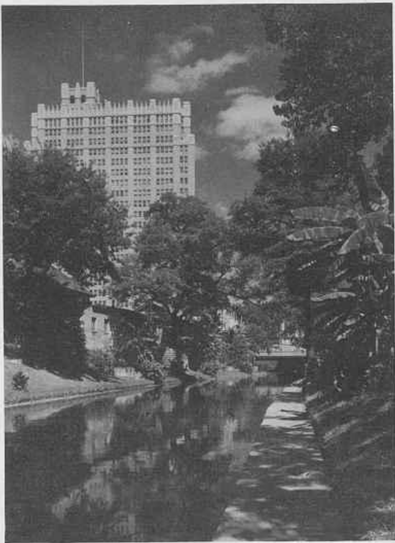
ALONG THE SAN ANTONIO RIVER